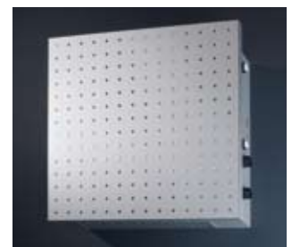
■ VIROXX Wall unit